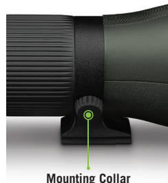
Mounting Collar Thumb Screw

Rotate the Diamondback® scope body for a variety of viewing positions — shown here with the angled eyepiece.