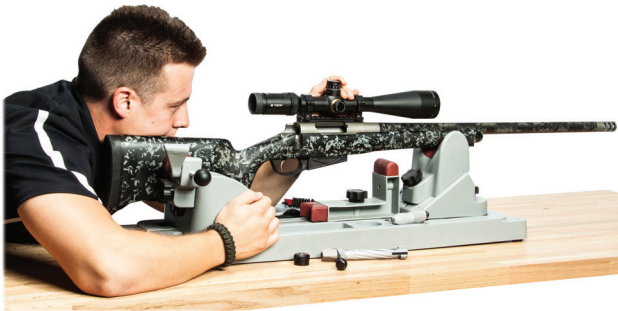
Visually bore-sighting a rifle.