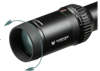
Adjust the reticle focus

Once this adjustment is complete, it will not be necessary to re-focus every time you use the rifle scope. However, because your eyesight may change over time, you should re-check this adjustment periodically.