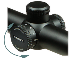
Adjust the side focus knob

Parallax is a phenomenon that results when the target image does not quite fall on the same optical plane as the reticle within the scope. When the shooter's eye is not precisely centered in the eyepiece, there can be apparent movement of the target in relation to the reticle, which can cause a small shift in the point of aim. Parallax error is most problematic for precision shooters using high magnification.